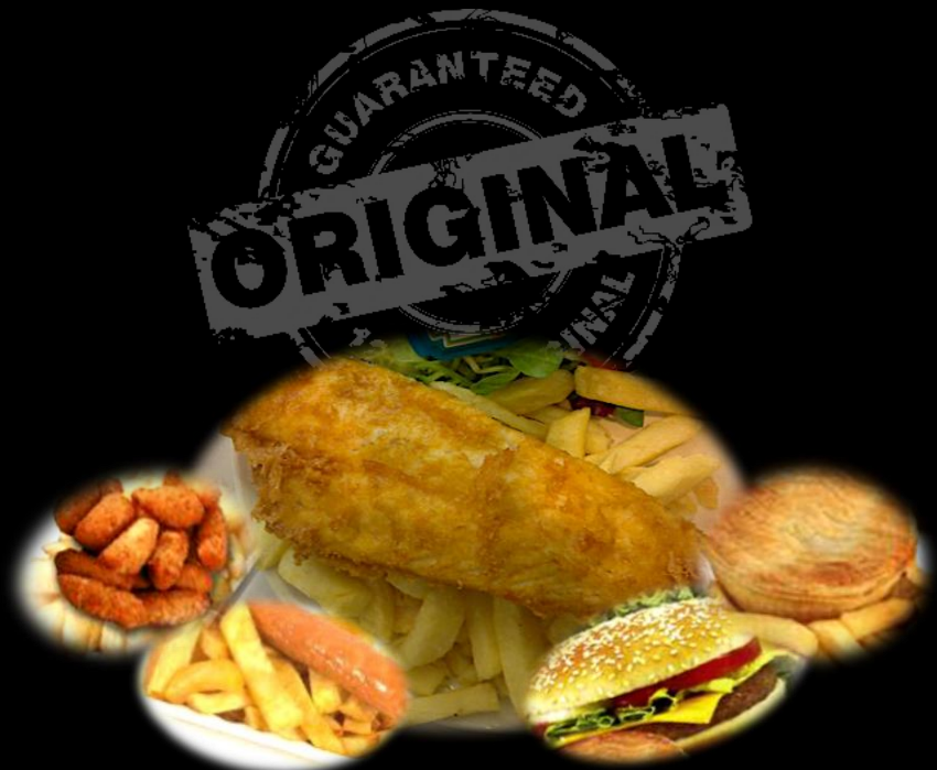
Table Bookings Welcome 01255 879063